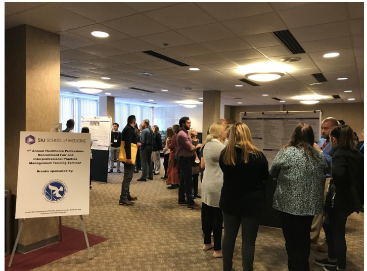
Students and local healthcare providers attended the PA-Phase II students poster session.

projects as a poster session in which faculty, residents, Physician Assistant - Phase I students, School of Allied Health students, and local healthcare providers were able to review the research posters and ask questions. The event was well attended and provided an interactive forum for all in attendance.