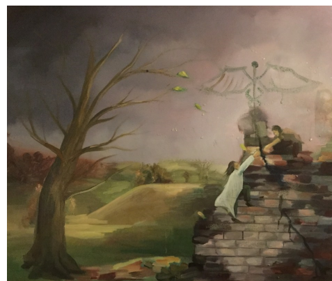
Bridging the Gap, one of the pieces included in our upcoming exhibit, by Zohal Ghulam-Jelani